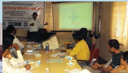
As part of the project, a Cluster Coordination Committee (CCC) was constituted with the following members